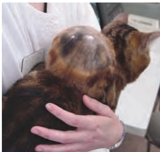
Figure 6 While vaccines are not uniquely implicated in sarcoma formation, there are certain actions that can be taken to reduce the risk of FISS, as summarized in Table 5.

FISS in individual cats presented for routine vaccination. Based on our current understanding of this problem, it is likely that vaccines are not uniquely implicated in the development of injection site sarcomas in cats. 56,60 FISS risk following vaccination likely results from a complex interaction of multiple extrinsic (eg, frequency and num-