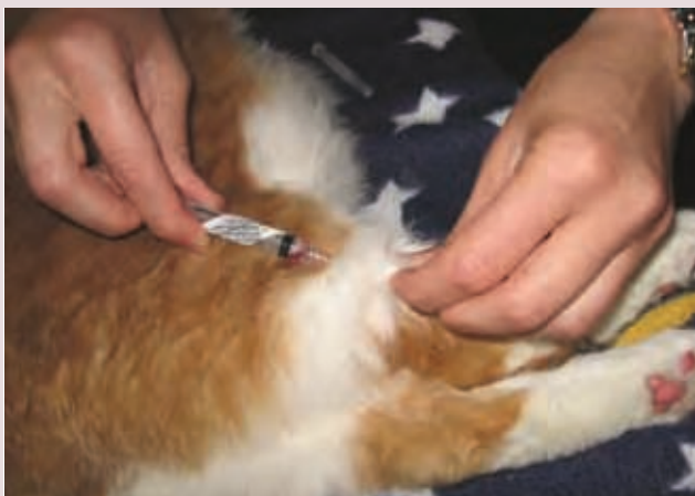
Figure 8 Administration of FeLV vaccine subcutaneously below the left stifle.