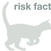
Figure 5 The number of litters produced per year in a breeding cattery is one of the key factors in determining the level of disease risk, and devising an appropriate vaccination program.

Vaccination programs for breeding catteries should be limited to those diseases that are relevant, determined by analysis of risk factors.