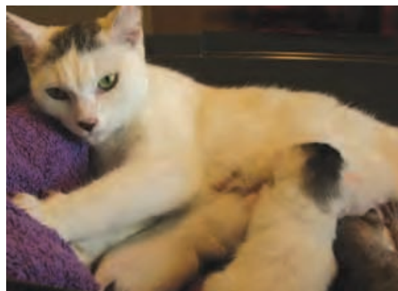
Figure 1 Kittens are more susceptible to infection than adult cats are, and are a principal primary target population for vaccination.

A Pet Owner Guide, discussing the risks and benefits of vaccination, is included as Appendix 2 (pages 807 and 808).