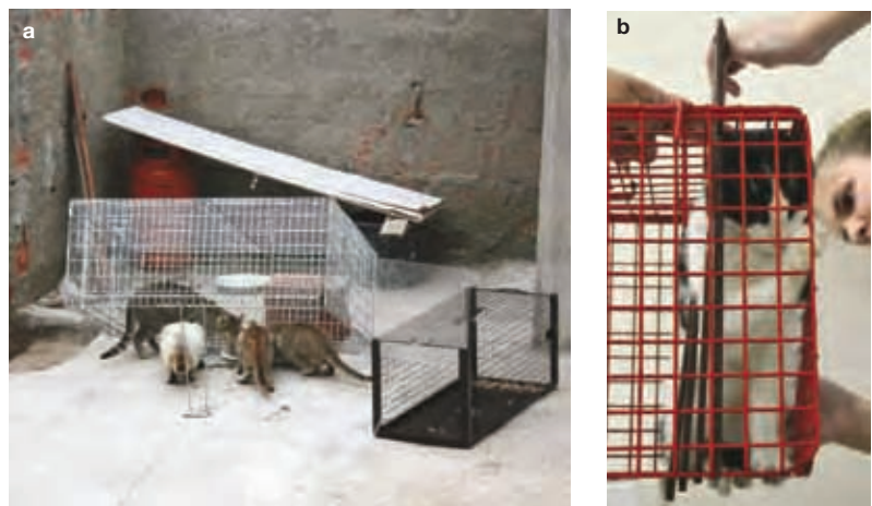
Figure 4 Community cats in TNR programs (a,b) should receive FPV, FHV-1, FCV and rabies vaccines at the time of surgery.

Vaccination programs for breeding catteries should be limited to those diseases that are relevant, determined by analysis of risk factors.