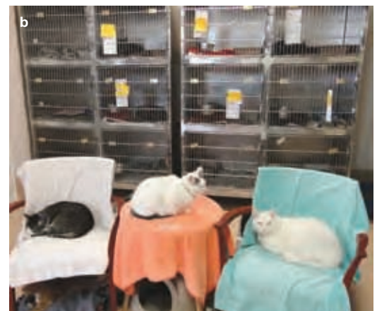
Figure 3 Generally, cats in shelters, whether individually (a) or group (b) housed, are at especially high risk of exposure to infectious disease.