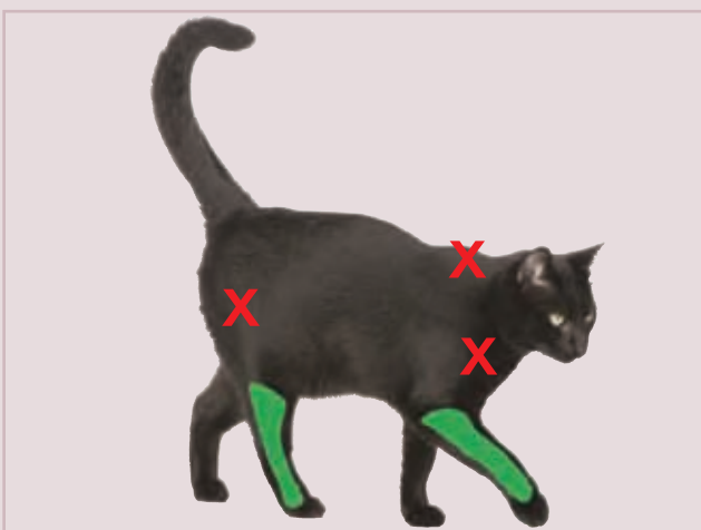
Figure 10 Regions indicated in green are recommended. Those in red are key sites that should be avoided.