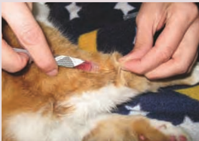
Figure 7 Administration of FPV, FHV-1, FCV vaccine subcutaneously below the right elbow.

Vaccines should be administered as low on the leg as possible. Caution is warranted when vaccinating cats resting in a crouched position as this may result in inadvertent injection of the skin fold of the flank. Veterinarians should note that data on the safety and efficacy of administering vaccines in very distal limb locations are lacking. Figure 10 shows recommended vaccination sites, as well as sites to avoid.