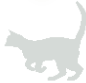
Figure 2 Pet cats that spend any time outdoors are at greater risk of exposure to many infectious diseases compared with indoor-only pet cats.

Veterinarians should reassess risk factors for exposure to infectious disease at least once a year, as changes in the health of the animal or its lifestyle may dictate modifications in vaccinations needed.